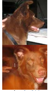
more from " mo " (aka- " Moses ")